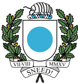
Republic of Icenia